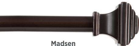
Madsen Weathered Brown