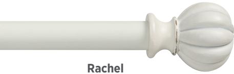
Rachel Antique White