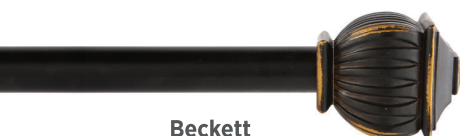
Beckett Oil Rubbed Bronze