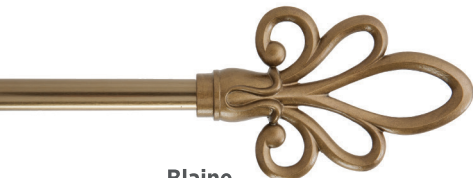
Blaine Antique Brass