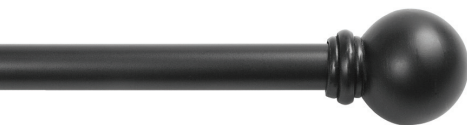
Chelsea Double Black Front rod: 5/8" (16mm) diameter Back rod: 5/8" (16mm) diameter