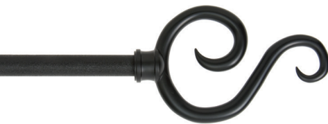
Scroll Hook Black